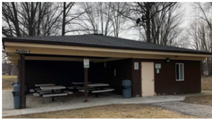
Community Cabin 35717 Bainbridge Rd. North Ridgeville, Oh 44039 Alternate Drop off & Pick Up