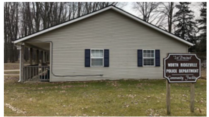
Safetyville Building 35753 Bainbridge Rd. North Ridgeville, OH 44039 Alternate Drop off & Pick Up