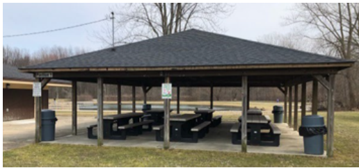
Pavilion 1 7565 Avon Belden Rd. North Ridgeville, OH 44049 Main Drop off & Pick Up

Safety is our priority, in the event of inclement weather the pickup and dropoff location may change. Please make sure to check your email.